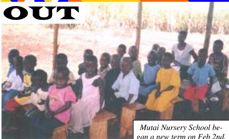
Mutai Nursery School began a new term on Feb 2nd.